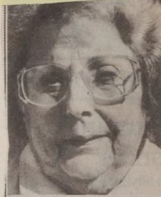
April 15, 1995