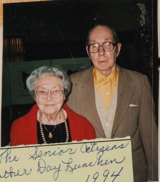
To: The Senior Citizens Mother Day Luncheon 1994