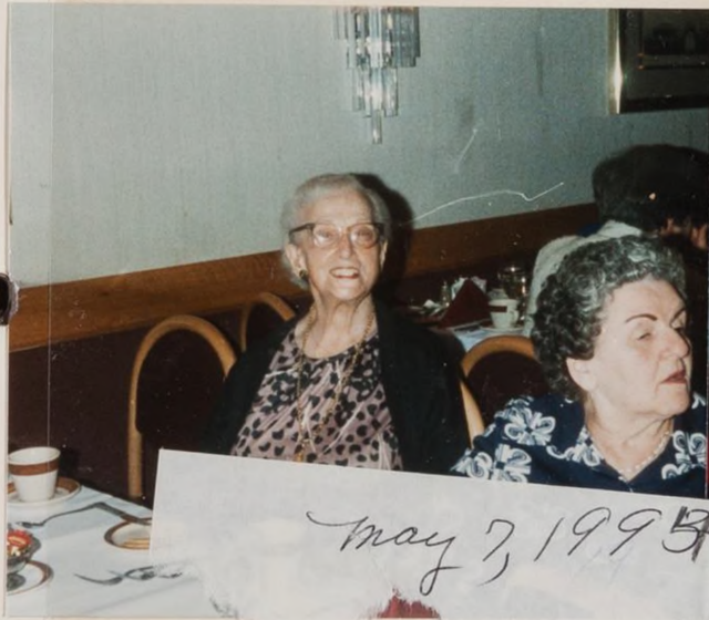
May 7, 1995