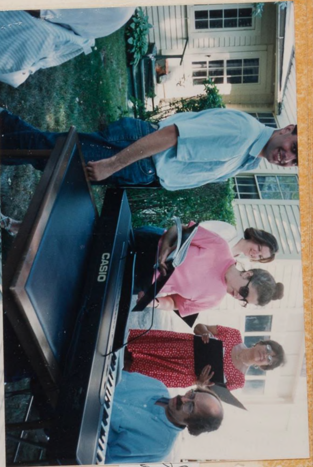
July 1993 Barberque.